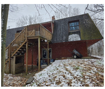
Calling all investors!