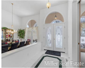
Miller Real Estate

A rare anchor property in the Indian Hills Golf Course community, this exceptional estate offers luxury, privacy, and private frontage on Carter Lake. Set on approximately 5 secluded acres, the setting is peaceful and park like while remaining close to Hastings amenities. Inside, expansive living spaces feature soaring tray ceilings and abundant natural light. The [...]