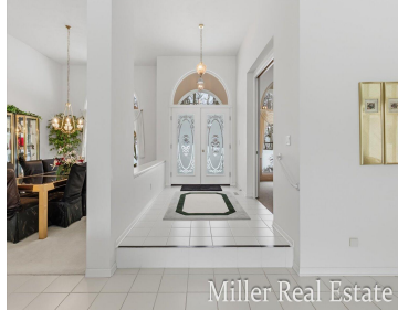
Miller Real Estate