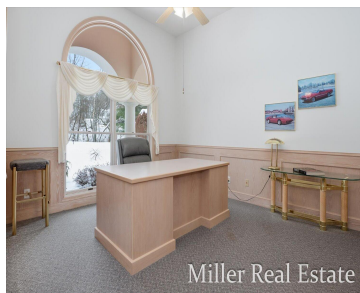
Miller Real Estate