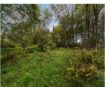
Terrific ~30 acres of land in downtown Fowlerville with access for development off of Ann Street. Adjacent to the community park!