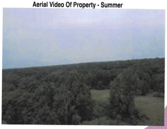
Aerial Video Of Property - Summer