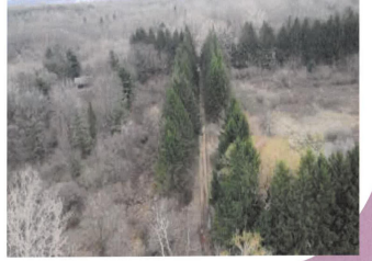
Aerial Video Of Property - Spring