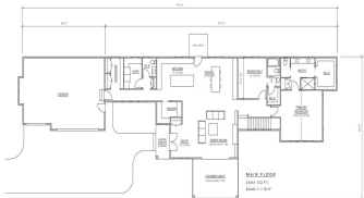
BENTWOOD SITE ONE © MAGNUSON BUILD & DESIGN, LLC