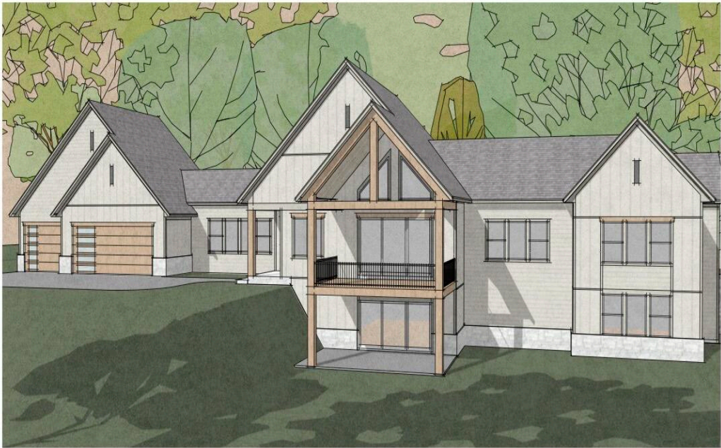
CONCEPTUALIZATION OF STREET ELEVATION