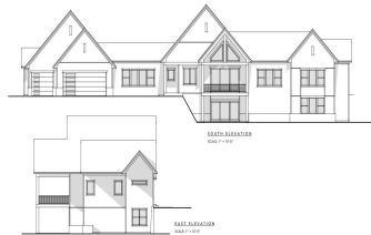
BENTWOOD SITE ONE © MAGNUSON BUILD & DESIGN, LLC