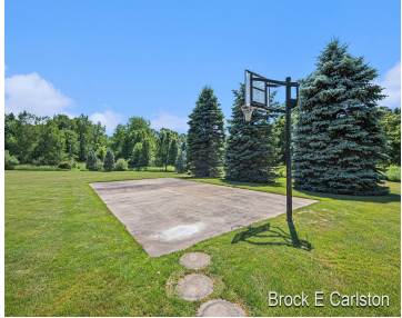
Brock E Carlston

This exclusive property at 7460 Fairbrother Lane is an opportunity that simply cannot be missed. Nestled on a private drive with only three other homes, this prestigious address offers a rare chance to call this exclusive enclave your own. Grandeur and Luxury: Ascend the grand staircase to this magnificent estate boasting 7,678 sq ft of [...]