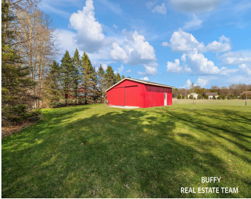
BUFFY REAL ESTATE TEAM

Set on nearly 5 picturesque acres, this fully renovated home at 7500 Tiffany Ave NE perfectly blends modern comfort with peaceful country living. Offering 4 bedrooms and 2 full bathrooms, along with a convenient main-floor laundry, every detail has been thoughtfully updated so you can move right in and enjoy. The finished walk-out lower level [...]