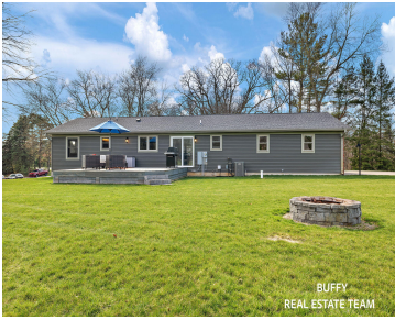
BUFFY REAL ESTATE TEAM