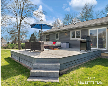
BUFFY REAL ESTATE TEAM