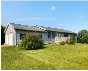
7895 E McBrides Rd; Edmore, MI 48829