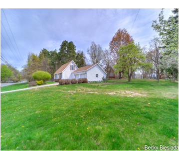
Charming 4- Bedroom Home in the Heart of Whitehall! Welcome to this beautifully maintained -4bedroom, 2-bath home located in a peaceful, residential neighborhood with in the desirable Whitehall School District. Step inside to find stunning new hardwood floors that flow throughout the main living areas, including the cozy living room with a gas fireplace-perfect for [...]