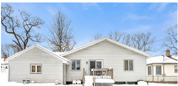
The Santa Center Team

Welcome home to this spacious 3 bedroom, 2 full bath ranch offering over 2,200sq ft of comfortable living space. The living room features a large picture window that fills the space with natural light, along with a cozy gas fireplace that serves as a warm focal point. A formal dining area offers dedicated space for [...]