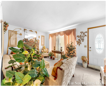
The Santa Center Team