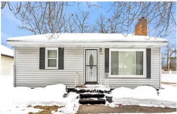
The Santa Center Team