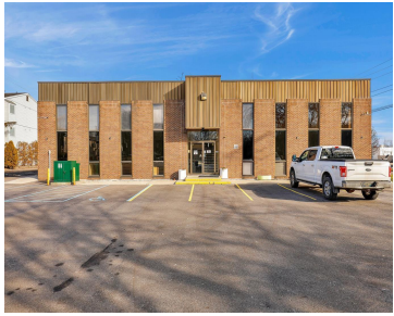
835 Louisa St. Ste. 102b