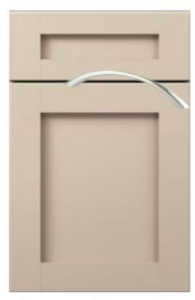
Fireplace & laundry room cabinets