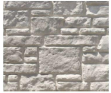
Prestige-White Onyx Southern Limestone