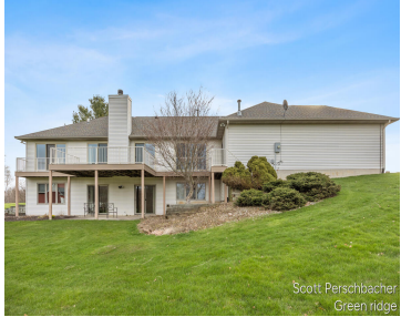
Scott Perschbacher Green ridge

Welcome to this great 4 bed 3.5 bath walk-out ranch in the desirable Shannon Ranch association. This home sits on a 2 acre corner lot, tucked back in the neighborhood. There is a 4 stall heated attached garage, as well as an out building that is big enough to hold up to 4 more cars [...]