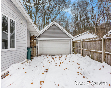
Brook E Carlston

This freshly updated 2-bed, 1-bath bungalow in the desirable Mona Shores School District offers comfortable living in a convenient location. The home features wood floors and ceramic tile, a main-floor laundry room, and a practical, easy-flow layout. Enjoy outdoor living on the covered deck overlooking the fenced-in yard, perfect for pets, play, or relaxing in [...]