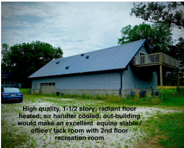
High quality, 1-1/2 story; radiant floor heated; air handler cooled; out-building would make an excellent equine stable / office / tack room with 2nd floor recreation room

70 acres in Union Pier with gorgeous views of the fields, pond and woods ready to be your equestrian estate. Plant your own hay & alfalfa on the 40 acres of tillable fields. There are about 20 acres of hardwoods (Maple, Beech, Oak and Walnut) which have not been logged. About 10 acres are mowed [...]