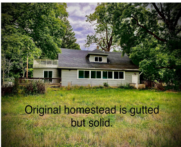
Original homestead is gutted but solid.