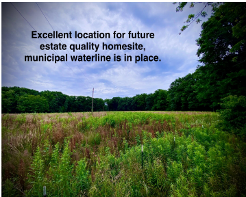
Excellent location for future estate quality homesite, municipal waterline is in place.