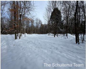
The Schuitema Team

Privacy on 5 acres! Hard to find acreage zoned AG-2 in Crockery Township and Fruitport Schools. Lot is cleared and ready to start building. Most of the leg work and clearing has been completed, build your homestead today on this sandy spot! Experience the privacy and the wildlife in a great area today! Land contract [...]