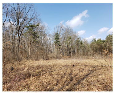
67 +/- acre hidden jewel that is very secluded but close to the town of Lawton. A hunters dream with mature woods and creek that transition to lowland bedding area. Excellent deer sign with many heavily traveled trails throughout. This is two parcels being sold as one. A select timber harvest was done approximately 3 [...]