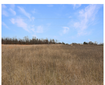
Fabulous 2.71 acre lot with a wonderful combination of rolling hills, woods, and field. Buyers can dream big while bringing their own builder to make their dreams a reality. With sandy soils and multiple build sites including a few options for a walkout basement, this parcel is ready for its new owner. Make it yours [...]