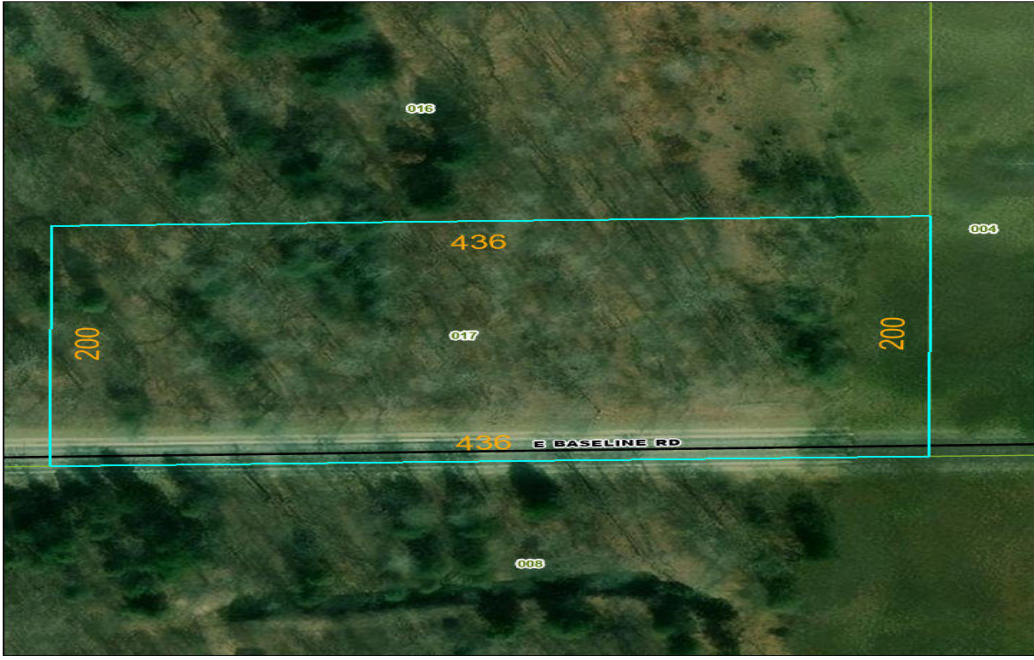
VL 2 acres Baseline 2