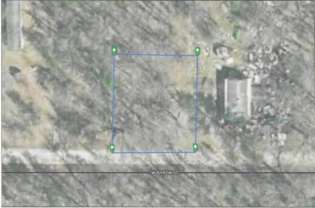
Vacant Land on W Byron Street